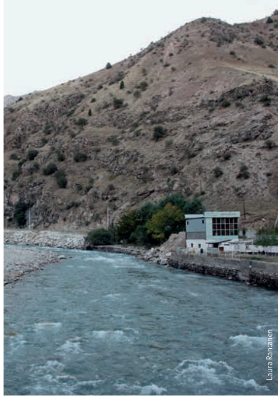
Mountainous view of Tajikistan.