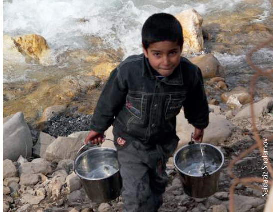
Boy fetching drinking water from a mountain river, Tajikistan.

The assessment will enable the national sector ministries, authorities and joint bodies (especially basin organisations) to better assess the interactions between water, food, energy and ecosystems in transboundary basins. The assessment will provide the following results: 1) Improved “nexus-knowledge base” of pressures on resources, needs and hotspots in the Syr-Darya basin; 2) Identification of the main inter-linkages, policy incoherencies, trade-offs and potential benefits; 3) Improved awareness of stakeholders and other actors of the Syr-Darya Basin of the nexus assessment and its policy recommendations. This assessment is part of a wider set of water-food-energy-ecosystems nexus assessments focusing on different transboundary basins in the pan-European region and beyond.