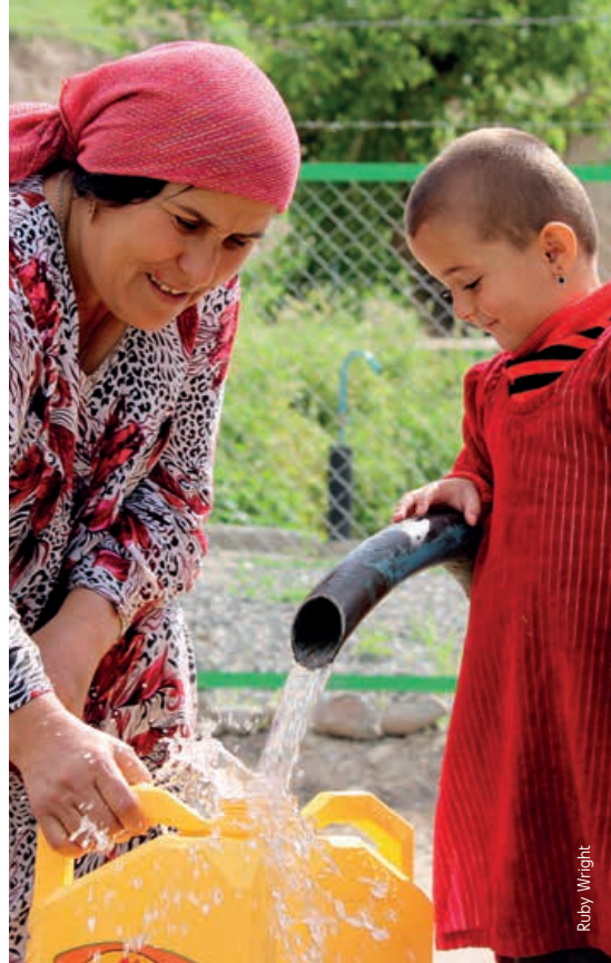
Shululu village, Muminabad district, Tajikistan.

The project aims at securing livelihoods for vulnerable women, men and children through efficient on-farm use of water and equitable community governance of water resources. The project will contribute to the adoption of measures for equitable and efficient water use by the population of target communities in their households and kitchen garden plots. This will be assisted through the education of secondary school students by improving their advocacy and communication skills to influence attitude change in their communities in favour of more equitable and efficient use of natural resources. The project will increase the capacity of local self-government and Water Users Associations in target areas to provide equal access to resources and enhanced services to the population. This will be facilitated by the use