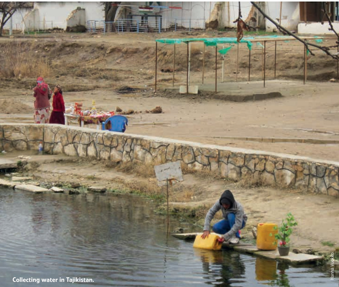
Collecting water in Tajikistan.