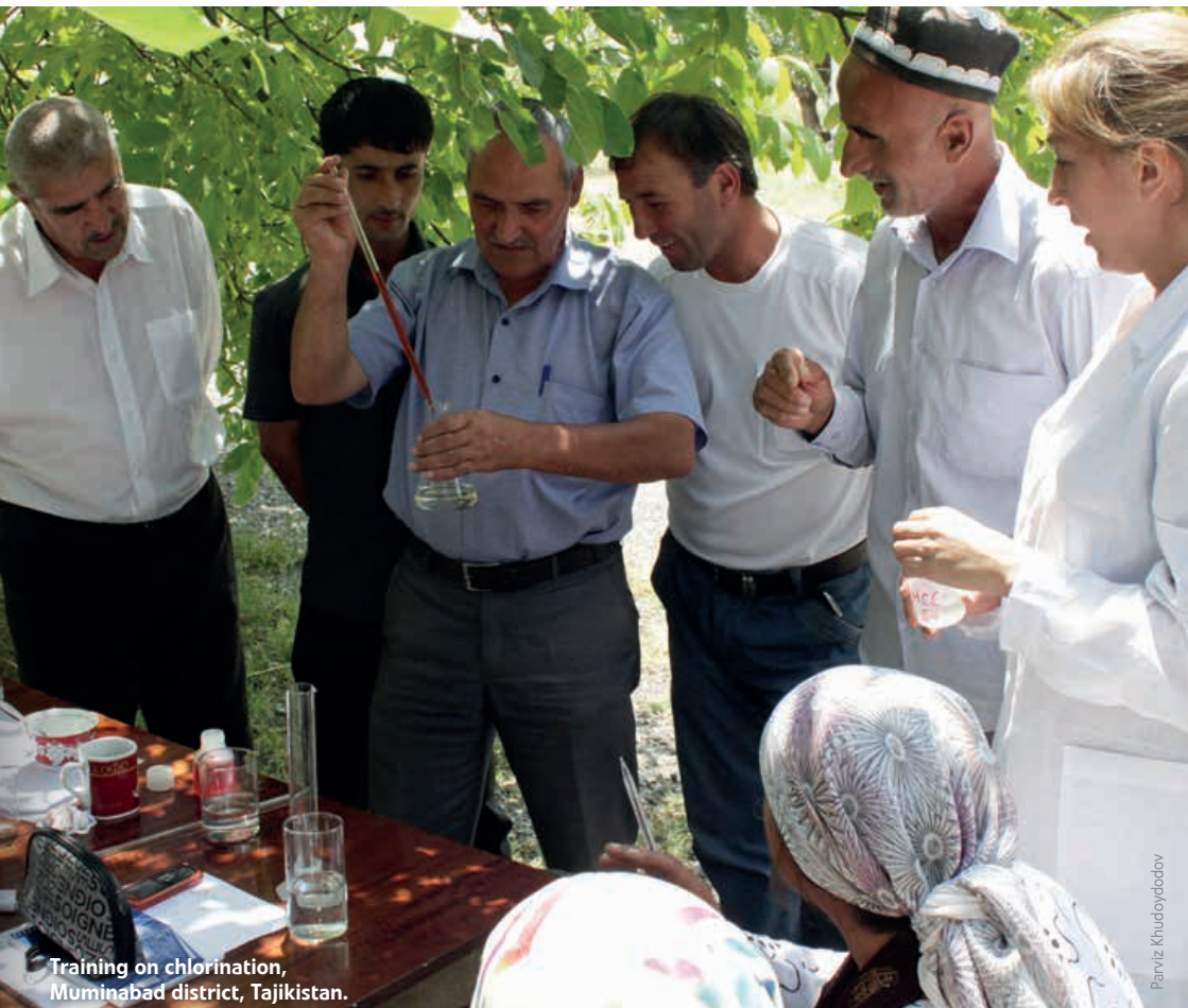
Training on chlorination, Muminabad district, Tajikistan.